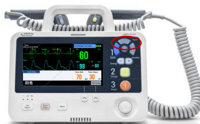
After Support Pacing