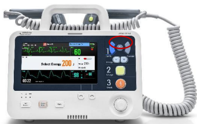
Before support Pacing